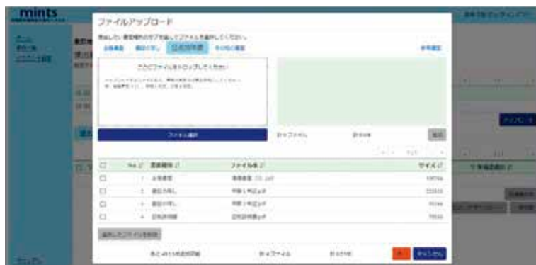
Screen for uploading documents via "mints" (mintsを利用した書面のアップロード画面)