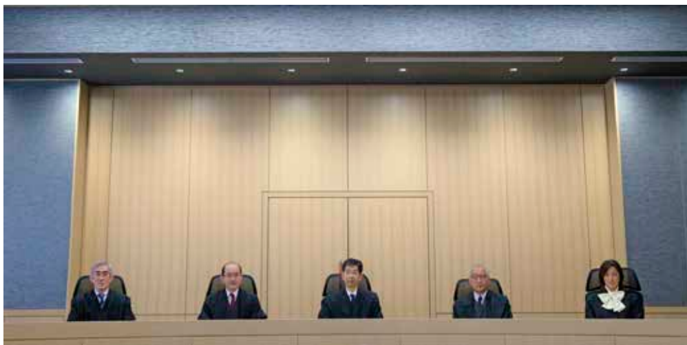
Grand Panel on the Bench（大合議体による審理）

大合議制度により、知的財産高等裁判所としての法的解釈の統一も図られることとなります。