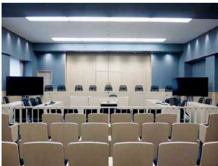
Courtroom for Grand Panel of the Intellectual Property High Court (知財高裁大合議法廷)

訴訟の目的の価額が140万円を超える民事訴訟事件の第一審は地方裁判所、同額を超えない民事訴訟の第一審は簡易裁判所ですが、知的財産権関係民事事件の第一審の大半は地方裁判所が取り扱っています。そして、我が国は、訴訟事件について、当事者が判決に不服があれば、原則として3段階までの審理及び裁判が受けられるという三審制度を採用していますので、地方裁判所の第一審判決の事実認定や法律の適用に不服がある場合には高等裁判所に控訴することができ、控訴審判決に対しては、法律問題について不服がある場合などに、最高裁判所に上告又は上告受理の申立てをすることができます。この点で、知的財産権関係民事事件は、他の民事事件と違いはありません。