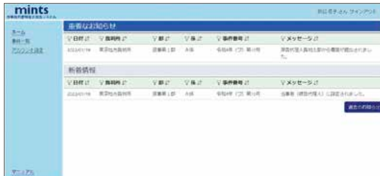
Home Screen of "mints" (mintsのホーム画面)

また、令和4年5月に成立した民事訴訟法等の一部を改正する法律において、訴えの提起から判決までの手続をオンライン化するための規定（訴状等のオンライン提出、ウェブ会議による口頭弁論期日等の実施、訴訟記録の電子化等の規定）が設けられました。同法は令和8年までに施行されることとなっており、同法施行後は、知的財産権関係訴訟手続のデジタル化がより一層進展する予定です。なお、当事者双方がウェブ会議により和解期日及び弁論準備手続期日に参加することを可能とする規定は、令和5年3月1日に施行されています。