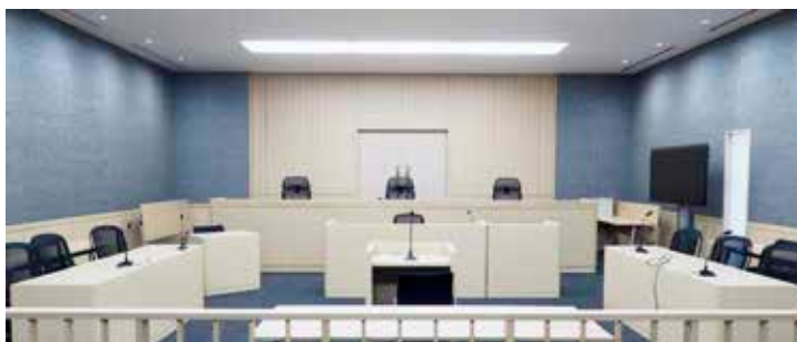
Courtroom for Three-judge Panel of the Intellectual Property High Court (知財高裁法廷)

Furthermore, the Act Partially Amending the Code of Civil Procedure, etc., which was enacted in May 2022, has introduced provisions for conducting proceedings online from the filing of an action to a judgment (e.g., provisions concerning online submission of complaints and other documents, use of a web conferencing system on the date for oral arguments, etc., and digitization of case records). The act will be put into effect by 2026, and digitalization in IP-related litigation is expected to further advance thereafter. The provisions that enable both parties to participate in a date for a settlement or preparatory proceedings online came into effect on March 1, 2023.