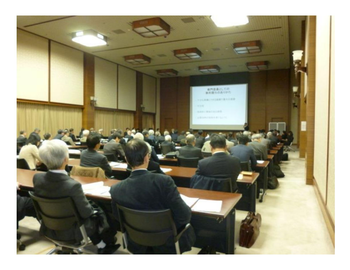
Practical case-study seminars for technical advisors