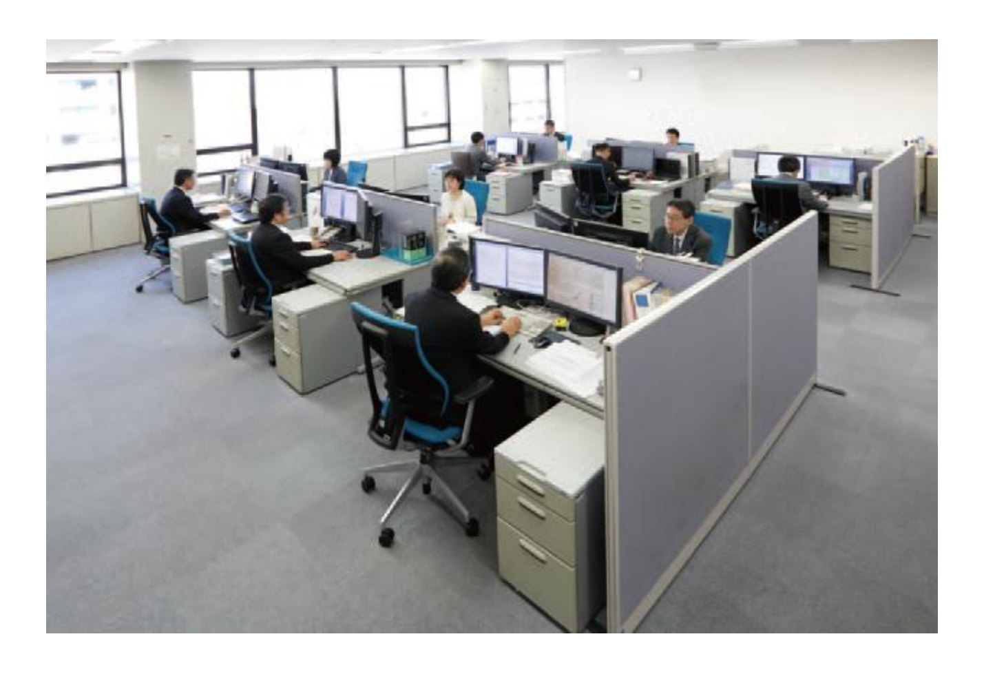
Office of Judicial Research Officials