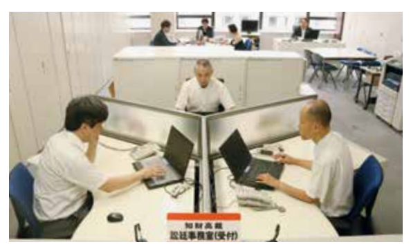
Registry/Secretariat Office (訟廷事務室・事務局)