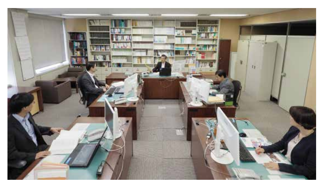
Judges' Chamber (裁判官室)

(6)特許権侵害訴訟の中には,裁判上の和解で解決されるものもあります。和解で解決された事件のかなりの部分は,特許権者に有利な方向での合意がされており,中には請求額の非常に大きな訴訟でも和解が成立したりしています。日本では,和解は,適切な解決を得るための効率的で迅速な手段と考えられています。