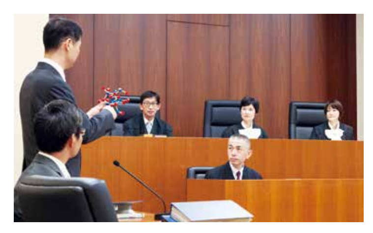
Examination by a Panel (合議体による審理)