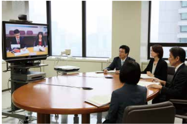
Party appearing in the IP High Court on a Date for Preparatory Proceedings (出頭した当事者)

このように，審決取消訴訟について，通常の訴訟事件とは異なり地方裁判所での審理が省略されているのは，特許庁の審判手続が裁判に類似する公正さが必要な準司法的手続として行われること，審決等が特許庁の専門的，技術的知見に基づいて行われていることによります。