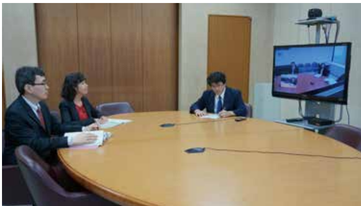
Adverse Party appearing in a distant Court to attend the same Date (遠隔地の当事者)

Preparatory Proceeding by TV-Conference System (テレビ会議システムの方法による弁論準備手続)