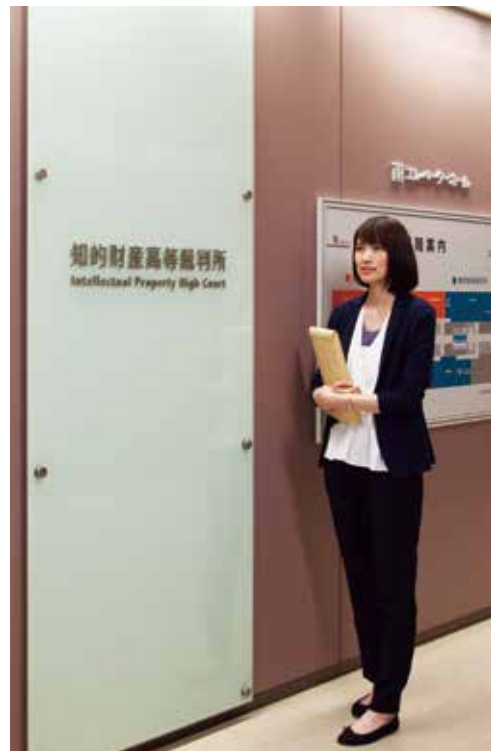
The Front Entrance of the IP High Court (知財高裁入口)

訴訟の目的の価額が140万円を超える民事訴訟事件の第一審は地方裁判所、同額を超えない民事訴訟の第一審は簡易裁判所ですが、知的財産権関係民事事件の第一審の大半は地方裁判所が取り扱っています。そして、我が国は、訴訟事件について、当事者が判決に不服があれば、原則として3段階までの審理及び裁判が受けられるという三審制度を採用していますので、地方裁判所の第一審判決の事実認定や法律の適用に不服がある場合には高等裁判所に控訴することができ、控訴審判決に対しては、法律問題について不服がある場合などに、最高裁判所に上告又は上告受理申立てをすることができます。この点で、知的財産権関係民事事件と他の民事事件との違いはありません。