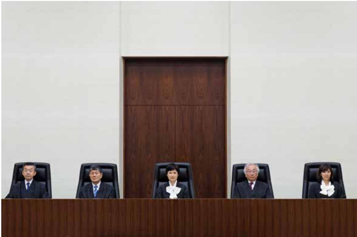
Grand Panel on the Bench (大合議体による審理)

Unlike an ordinary lawsuit, proceedings at a district court are omitted in the case of a suit against an appeal/trial decision made by the JPO. This is because the JPO trial procedure is conducted as quasi-judicial proceedings, which require a high level of fairness similar to that required in judicial proceedings and also because the JPO decision is made based on specialized, technical knowledge possessed by the JPO.