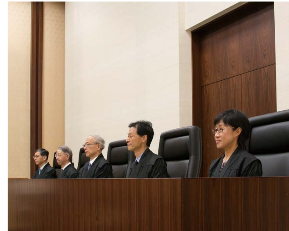
Grand Panel (大合議体)

このように、審決取消訴訟について、通常の訴訟事件とは異なり地方裁判所での審理が省略されているのは、特許庁の審判手続が裁判に類似する公正さが必要な準司法的手続として行われること、審決等が特許庁の専門的、技術的知見に基づいて行われていることによります。