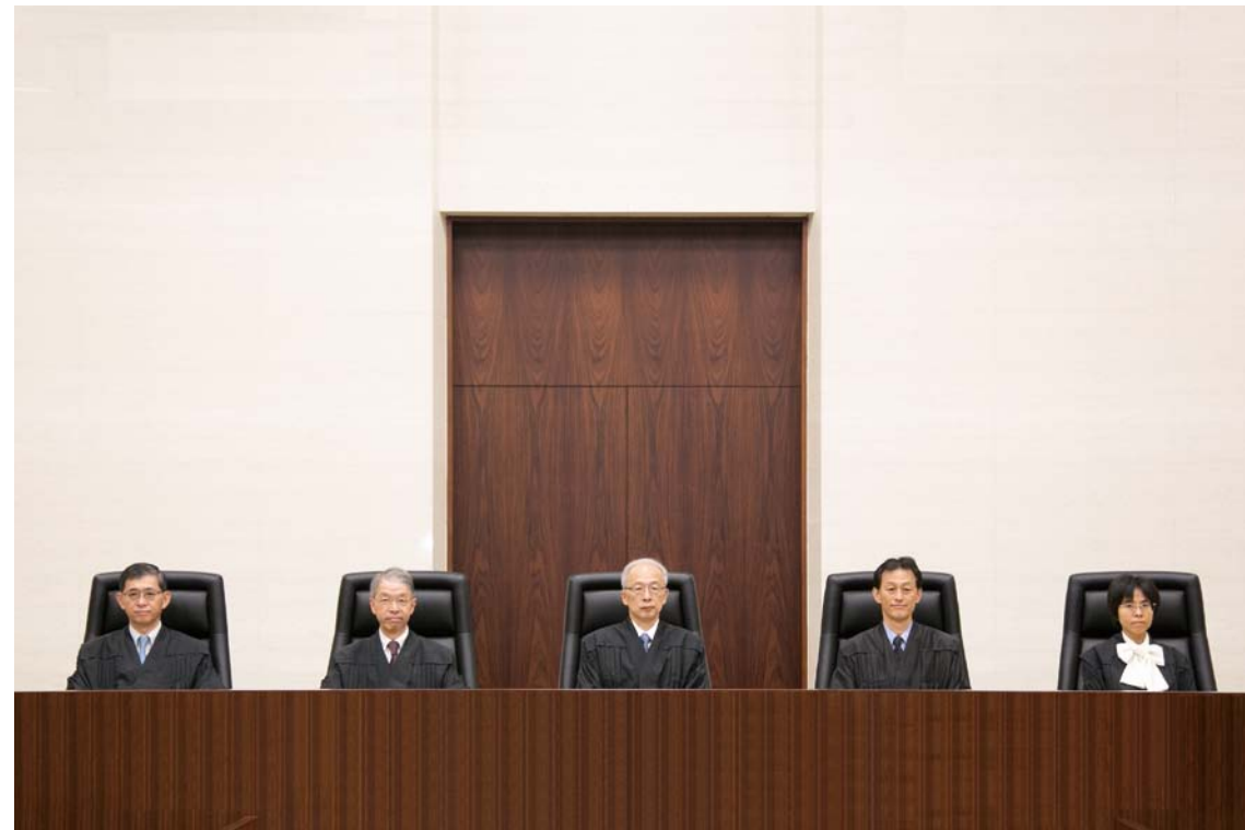
Grand Panel (大合議体)

In this way, in the case of a suit against an appeal/trial decision made by the JPO, unlike an ordinary lawsuit, proceedings at a district court are omitted. This is because the JPO trial procedure is conducted as quasi-judicial proceedings, which require a high level of fairness similar to that required in judicial proceedings and also because the JPO decision is made based on specialized, technical knowledge possessed by the JPO.