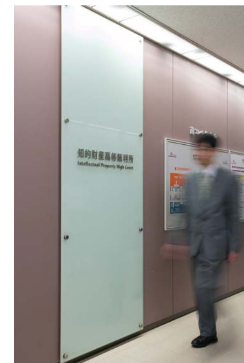
The Front Entrance of the IP High Court (知財高裁入口)

訴訟の目的の価額が140万円を超える民事訴訟事件の第一審は地方裁判所、同額を超えない民事訴訟の第一審は簡易裁判所ですが、知的財産権関係民事事件の第一審の大半は地方裁判所が取り扱っています。そして、我が国は、訴訟事件について、当事者が判決に不服があれば、原則として3段階までの審理及び裁判が受けられるという三審制度を採用していますので、地方裁判所の第一審判決の事実認定や法律の適用に不服がある場合には高等裁判所に控訴することができ、控訴審判決に対しては、法律問題について不服がある場合などに、最高裁判所に上告又は上告受理申立てをすることができます。この点で、知的財産権関係民事事件と他の民事事件との違いはありません。