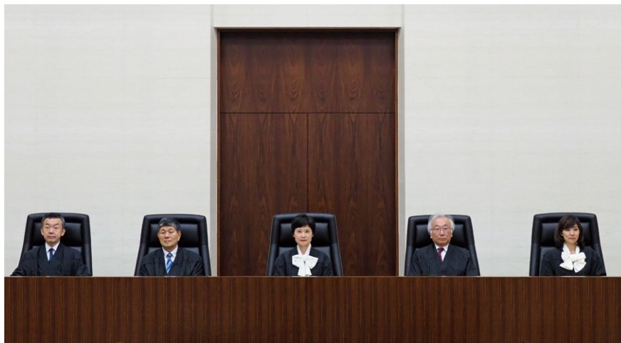
Grand Panel on the Bench（大合議体による審理）

大合議制度により、知的財産高等裁判所としての法的解釈の統一も図られることとなります。