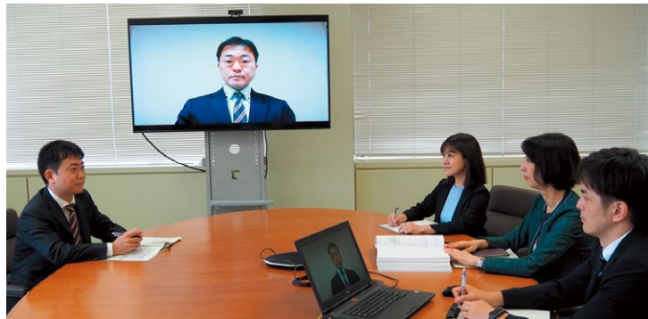
Proceedings where one of the parties appears in court (弁論準備手続期日・一方当事者不出頭型)

このように、審決取消訴訟について、通常の訴訟事件とは異なり地方裁判所での審理が省略されているのは、特許庁の審判手続が裁判に類似する公正さが必要な準司法的手続として行われること、審決等が特許庁の専門的、技術的知見に基づいて行われていることによります。