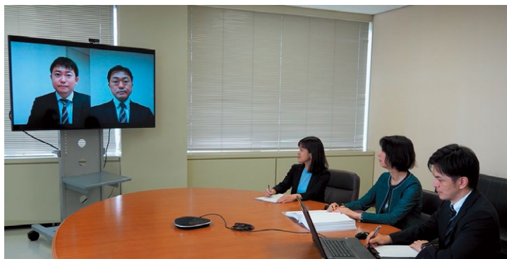
Proceedings without the appearance of the parties (書面による準備手続・双方当事者不出頭型)

A web conference system (a system for video calling via an ordinary internet connection, which enables real time communications by means of not only audio and video but also texts and files) is available on an as-needed basis in proceedings to arrange issues and evidence. There are two types of proceedings using this system: proceedings where one of the parties appears in court (Upper Photo); and proceedings without the appearance of the parties (Lower Photo) 争点整理手続については、必要に応じ、ウェブ会議（一般のインターネット回線を介したビデオ会話であり、音声及び映像だけでなく、文字やファイル等を用いてリアルタイムのコミュニケーションを図ることが可能な会議）が利用されている。一方の当事者が出頭して行う手続（写真上）と、双方の当事者が出頭せずに行う手続（写真下）がある。