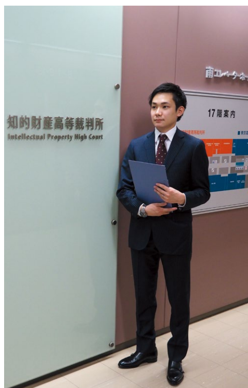
The Front Entrance of the IP High Court (知財高裁入口)

訴訟の目的の価額が140万円を超える民事訴訟事件の第一審は地方裁判所，同額を超えない民事訴訟の第一審は簡易裁判所ですが，知的財産権関係民事事件の第一審の大半は地方裁判所が取り扱っています。そして，我が国は，訴訟事件について，当事者が判決に不服があれば，原則として3段階までの審理及び裁判が受けられるという三審制度を採用していますので，地方裁判所の第一審判決の事実認定や法律の適用に不服がある場合には高等裁判所に控訴することができ，控訴審判決に対しては，法律問題について不服がある場合などに，最高裁判所に上告又は上告受理申立てをすることができます。この点で，知的財産権関係民事事件と他の民事事件との違いはありません。