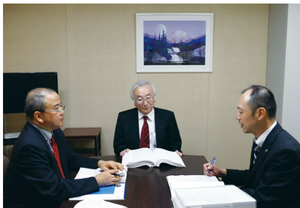
Discussion by a Panel (合議体による評議)