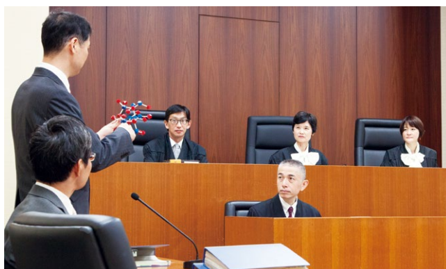
Examination by a Panel (合議体による審理)

Unlike an ordinary lawsuit, proceedings at a district court are omitted in the case of a suit against appeal/trial decision made by the JPO. This is because the JPO trial procedure is conducted as quasi-judicial proceedings, which require a high level of fairness similar to that required in judicial proceedings, and also because the JPO makes decisions based on specialized, technical knowledge possessed by the JPO.