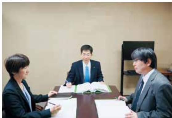
Discussion by a Panel (合議体による評議)