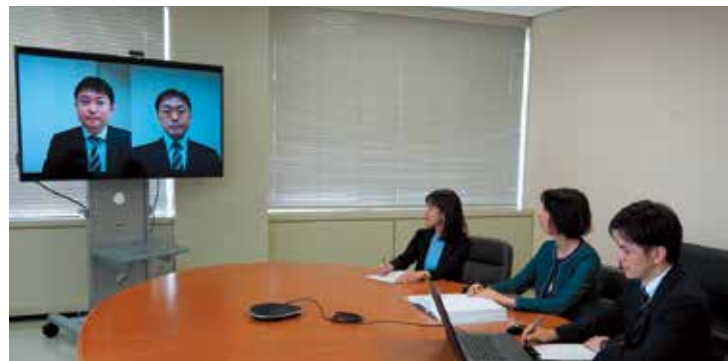
Proceedings without the appearance of the parties （書面による準備手続・双方当事者不出頭型）

我が国では，現在，民事訴訟手続のIT化の検討が進められており，このうち争点整理手続においては，ウェブ会議（一般のインターネット回線を介したビデオ通話で，音声及び映像だけでなく，文字やファイル等を用いたコミュニケーションが可能なシステム）が利用されています。この場合，双方の当事者が裁判所に出頭せずに行う手続（書面による準備手続の場合）と一方の当事者のみが裁判所に出頭して行う手続（弁論準備手続の場合）があります。