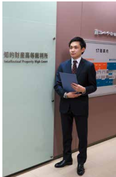
The Front Entrance of the IP High Court (知財高裁入口)

訴訟の目的の価額が140万円を超える民事訴訟事件の第一審は地方裁判所、同額を超えない民事訴訟の第一審は簡易裁判所ですが、知的財産権関係民事事件の第一審の大半は地方裁判所が取り扱っています。そして、我が国は、訴訟事件について、当事者が判決に不服があれば、原則として3段階までの審理及び裁判が受けられるという三審制度を採用していますので、地方裁判所の第一審判決の事実認定や法律の適用に不服がある場合には高等裁判所に控訴することができ、控訴審判決に対しては、法律問題について不服がある場合などに、最高裁判所に上告又は上告受理の申立てをすることができます。この点で、知的財産権関係民事事件は、他の民事事件と違いはありません。