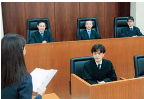
Examination by a Panel (合議体による審理)

In Japan, the introduction of information technology in court proceedings of civil cases is currently making progress, and a web conferencing system (a system for video-calling via an ordinary internet connection, which enables communications by means of not only audio and video but also texts and other files) has already been put into use in proceedings to arrange issues and evidence. There are two types of proceedings using this system: proceedings wherein both parties do not appear in court (Written Preparatory Proceedings); and proceedings wherein one of the parties appears in court (Preparatory Proceedings).