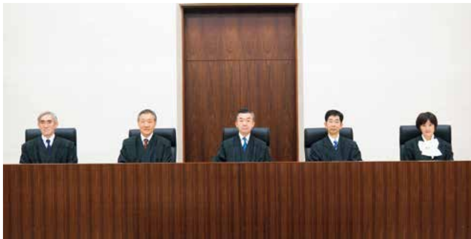
Grand Panel on the Bench（大合議体による審理）

大合議制度により、知的財産高等裁判所としての法的解釈の統一も図られることとなります。