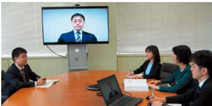
Proceedings where one of the parties appears in court （弁論準備手続期日・一方当事者不出頭型）