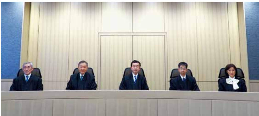
Grand Panel on the Bench（大合議体による審理）

大合議制度により、知的財産高等裁判所としての法的解釈の統一も図られることとなります。