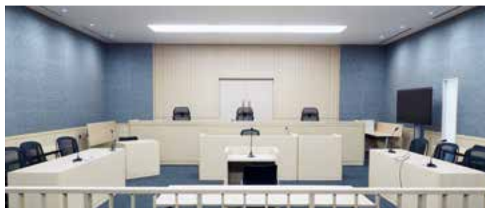
Courtroom for Three-judge Panel of the Intellectual Property High Court (知財高裁法廷)

Furthermore, the Act Partially Amending the Code of Civil Procedure, etc., which was enacted in May 2022, has introduced provisions for conducting proceedings online from the filing of an action to a judgment (e.g., provisions concerning online submission of complaints and other documents, use of a web conferencing system on the date for oral arguments, etc., and digitization of case records). The act will be put into effect by 2026, and digitalization in IP-related litigation is expected to further advance thereafter.