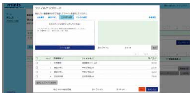
Screen for uploading documents via "mints" (mintsを利用した書面のアップロード画面)