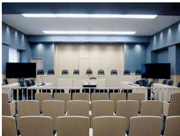
Courtroom for Grand Panel of the Intellectual Property High Court (知財高裁大合議法廷)

訴訟の目的の価額が140万円を超える民事訴訟事件の第一審は地方裁判所、同額を超えない民事訴訟の第一審は簡易裁判所ですが、知的財産権関係民事事件の第一審の大半は地方裁判所が取り扱っています。そして、我が国は、訴訟事件について、当事者が判決に不服があれば、原則として3段階までの審理及び裁判が受けられるという三審制度を採用していますので、地方裁判所の第一審判決の事実認定や法律の適用に不服がある場合には高等裁判所に控訴することができ、控訴審判決に対しては、法律問題について不服がある場合などに、最高裁判所に上告又は上告受理の申立てをすることができます。この点で、知的財産権関係民事事件は、他の民事事件と違いはありません。