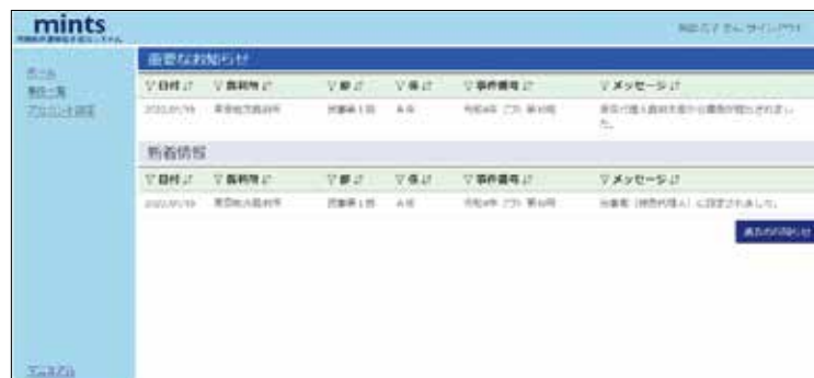
Home Screen of "mints" (mintsのホーム画面)

また、令和4年5月に成立した民事訴訟法等の一部を改正する法律において、訴えの提起から判決までの手続をオンライン化するための規定（訴状等のオンライン提出、ウェブ会議による口頭弁論期日等の実施、訴訟記録の電子化等の規定）が設けられました。同法は令和8年までに施行されることとなっており、同法施行後は、知的財産権関係訴訟手続のデジタル化がより一層進展する予定です。